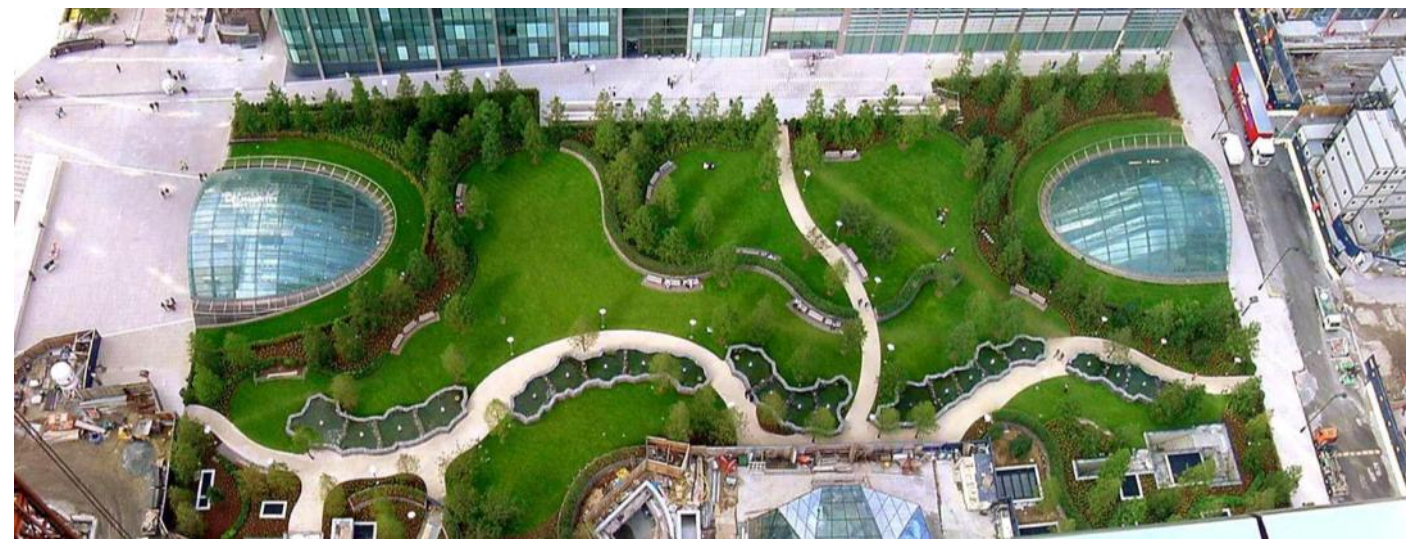
The "Jubilee Park" from above, surrounded of high buildings.